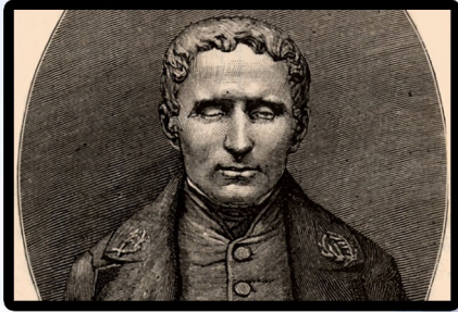
Louis Braille: Invented a system of reading and writing for the blind.