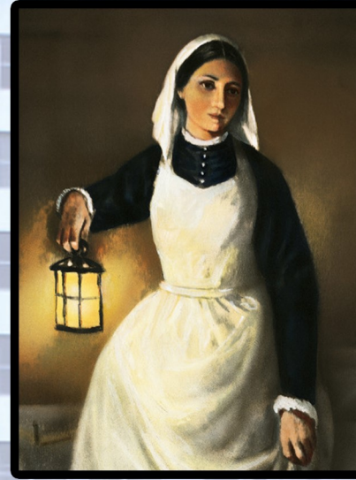
Florence Nightingale: Improved standards of healthcare in hospitals and built training schools for nurses.