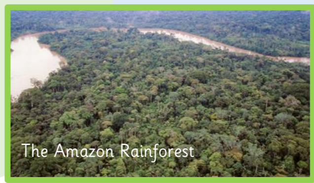
The Amazon Rainforest