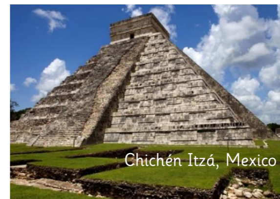
Chichén Itzá, Mexico