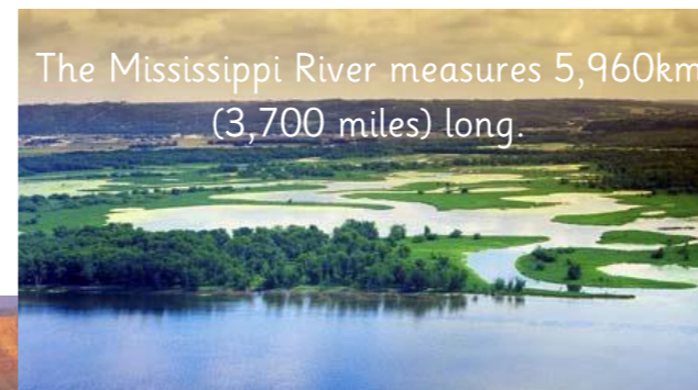
The Mississippi River measures 5,960km (3,700 miles) long.