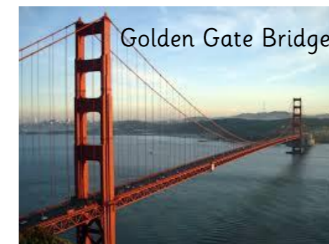
Golden Gate Bridge