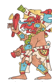
Brought rain for crops Created storms, thunder and lightning