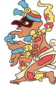
One of the creator Gods Inventor of Writing