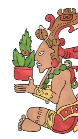
Humans were created from maize dough