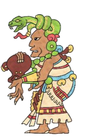
Wife of Itzamna Goddess of childbirth, healing and weaving