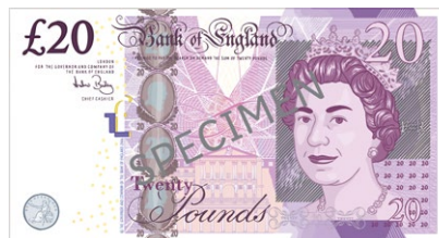
£20 twenty pound note