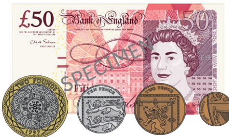
£52 and 13 pence