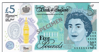
£5 five pound note