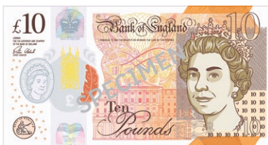
£10 ten pound note