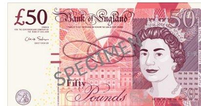
£50 fifty pound note