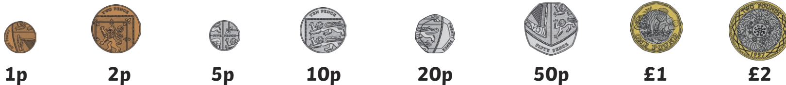
one penny coin two pence coin five pence coin ten pence coin twenty pence coin fifty pence coin one pound coin two pound coin